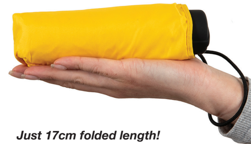
Just 17cm folded length!

The protective case can also be printed on ONE side for an extra cost. See the Surcharges page on our website for pricing.